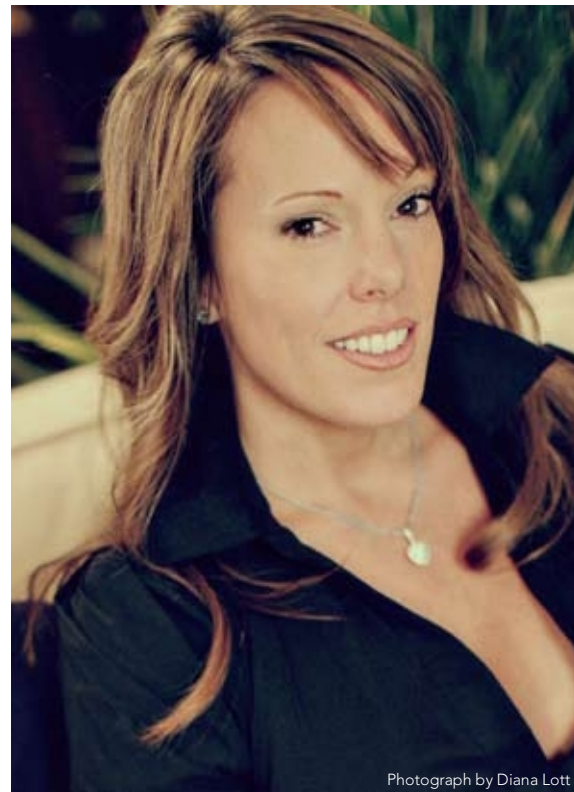
Photograph by Diana Lott