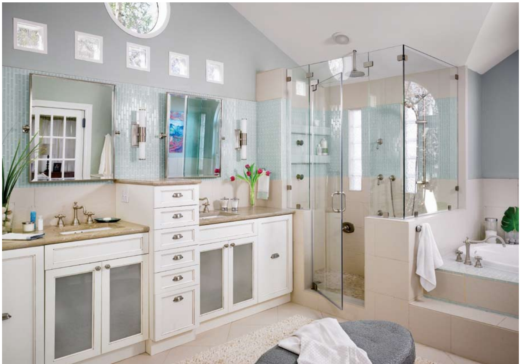
ABOVE: The floor and wall tiles are reminiscent of the sandy beaches of the homeowners' wedding location. Fossils hide in the natural stone countertops, awaiting discovery. Design by Laura Britt Design