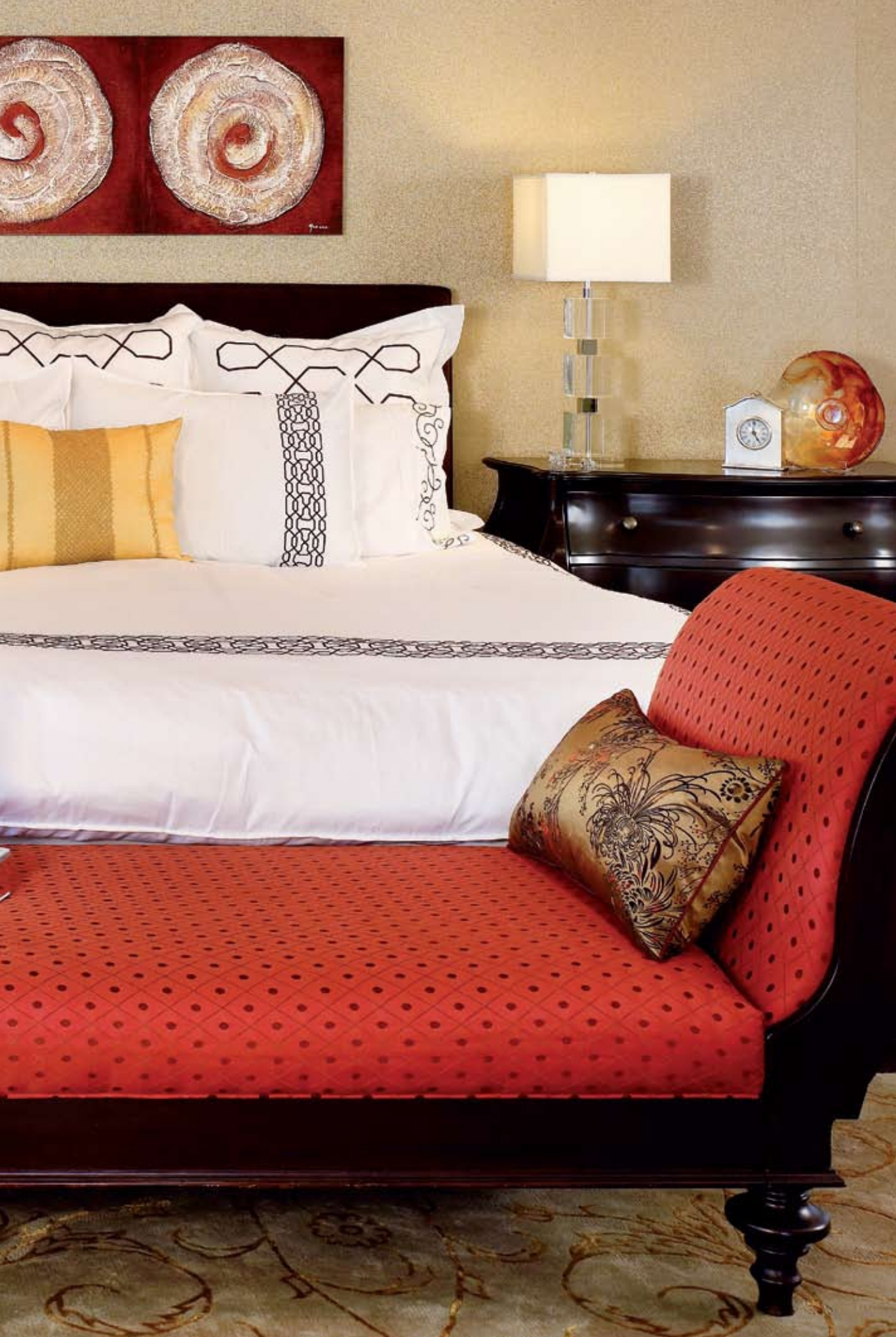
LEFT: Furnished boudoir-style, beaded wallpaper swathes the wall behind the bed. An eye-catching Monica Aroaz painting pulls the color scheme together. Design by Spaces Designed