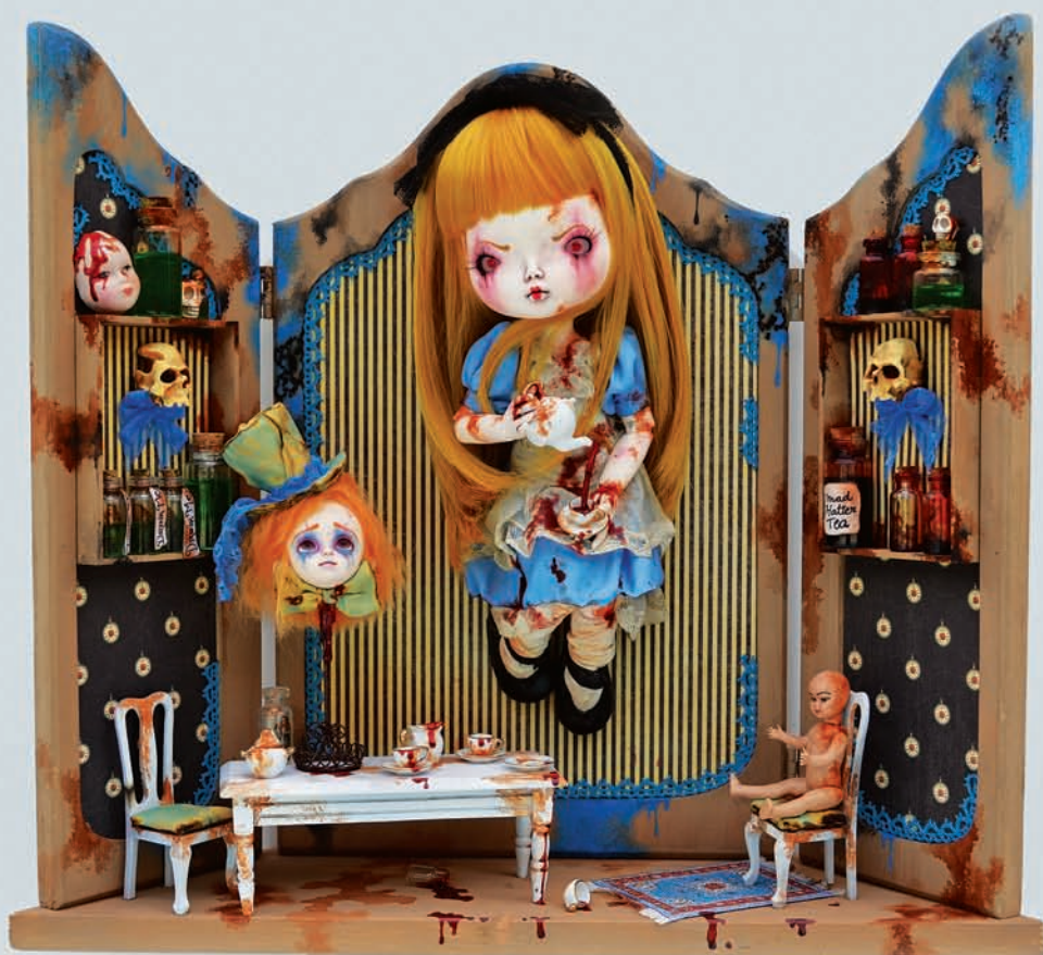
Sally's Song Dolls